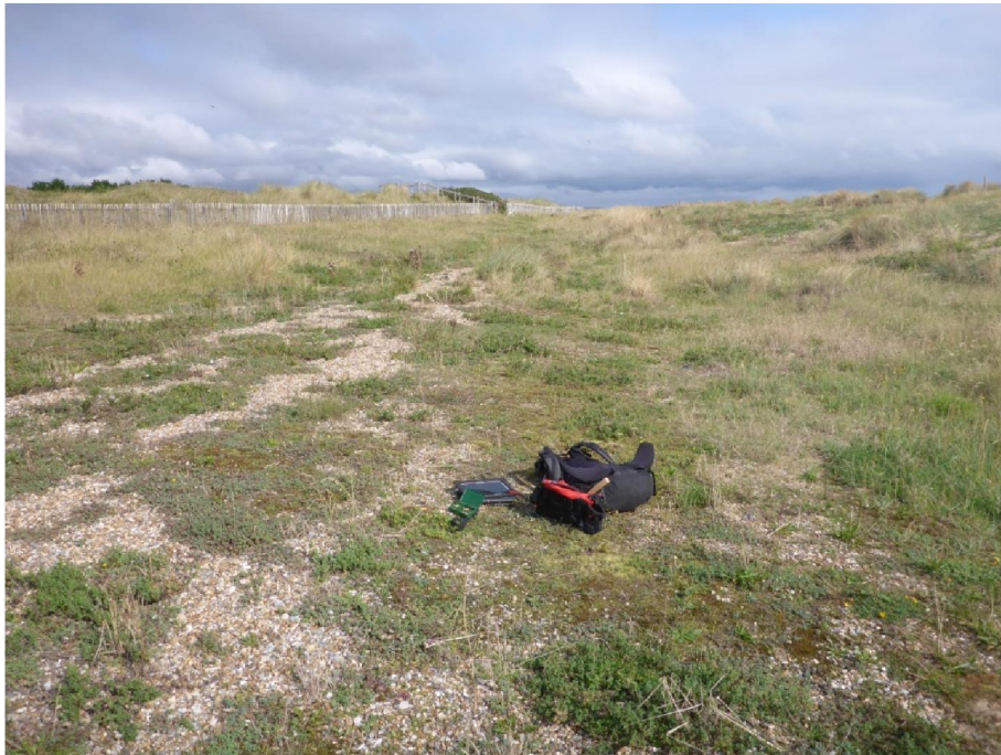
Figure 4.8 Closer view of the shingle habitat (showing the distinctive yellow patches of Xanthoria parietina ).