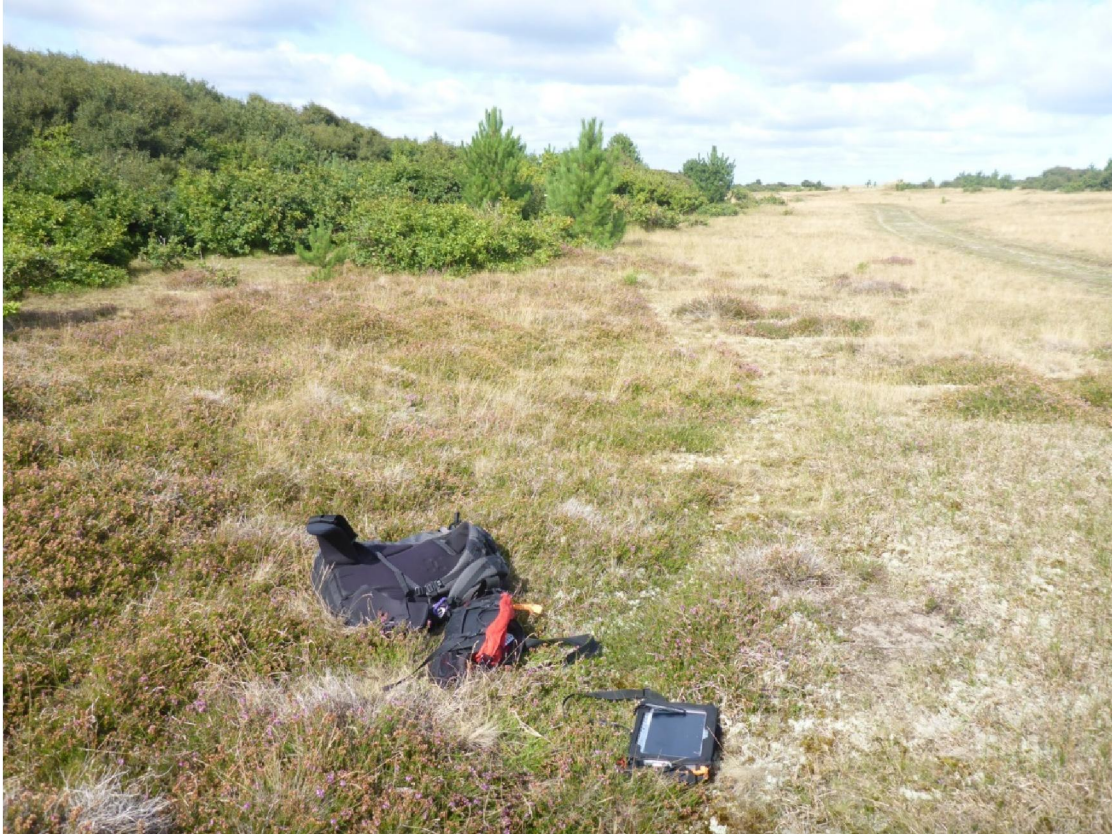
Figure 4.6 Coastal Erica cinerea heath at TN4. The lichens are best developed where the dense ericoid sward is broken by small tracks and depressions through the heathy patches caused by animal grazing/trampling.