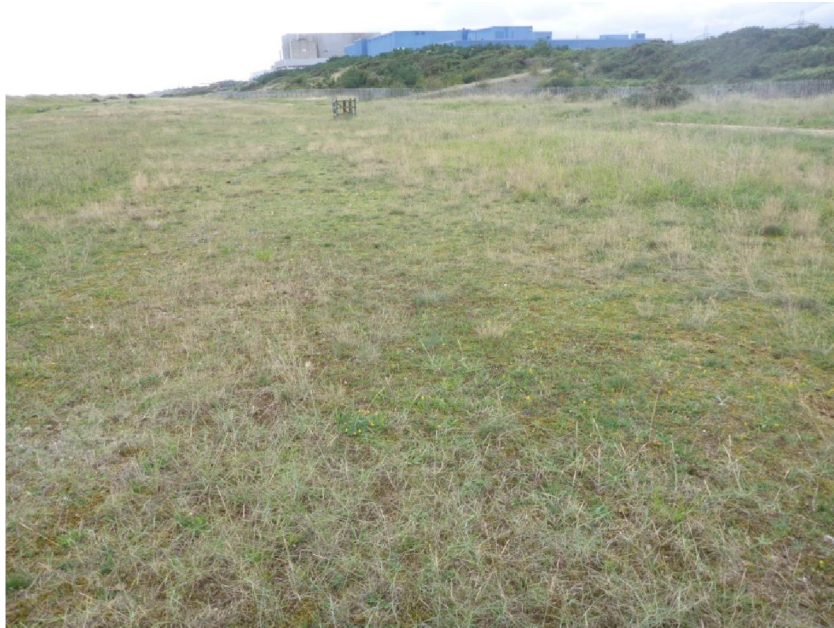
Figure 4.5 Dune grassland at TN16 with some exposed but stable shingly hollows and ridges. This area supported abundant Cetraria aculeata .